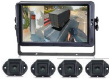
Stortech 360° 7\"/>