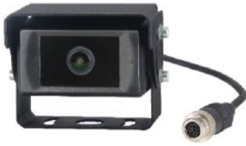
Stortech AI Pedestrian Detection Camera