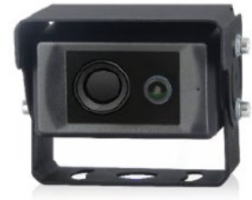
Stortech AI Dual Thermal/Optical Camera