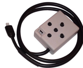
Optional OSD Controller

Special icons are shown at the top of the Menu, each with a drop-down Submenu. This will guide the installer through Quick and Easy Setup